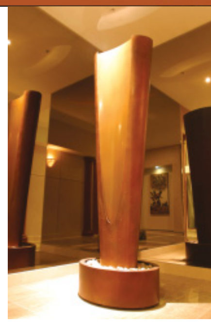
ART, SCULPTURE, AND FINE APPOINTMENTS ABOUND AT CAMINO ALTOS PLAZA

Rarely does one find more prestige. Camino Altos Plaza is widely regarded as the finest Office Building ever built in this region, and for very good reason. It is considered an emerging Landmark. With lobbies of marble and granite, custom-commissioned art and sculpture, elevator panelled with fine hard wood, bronze mirror and textured brass, elegant suite entrances of polished cherry and faux stonework, and abundant private secured parking – featuring two professionally decorated interior Parque Plazas, you and your clients are in for a treat. From 5-star hotel-quality restrooms, to the Executive Shower Room, whether you take a limo, a car, or walk to work, and whether you bike or jog at lunchtime, you may keep in shape and stay fully refreshed without ever leaving! And with the simple or gournet meals available to you (at pre-arranged discount) at the beautiful Crowne Plaza Indoor/Outdoor Restaurant next door, and with one adjoining and one local Marriott to choose from for your out-of-town visitors, welcome to the world of unsurpassed business comfort and elegant luxury, a world of unique ambiance: Welcome to Camino Altos Plaza.